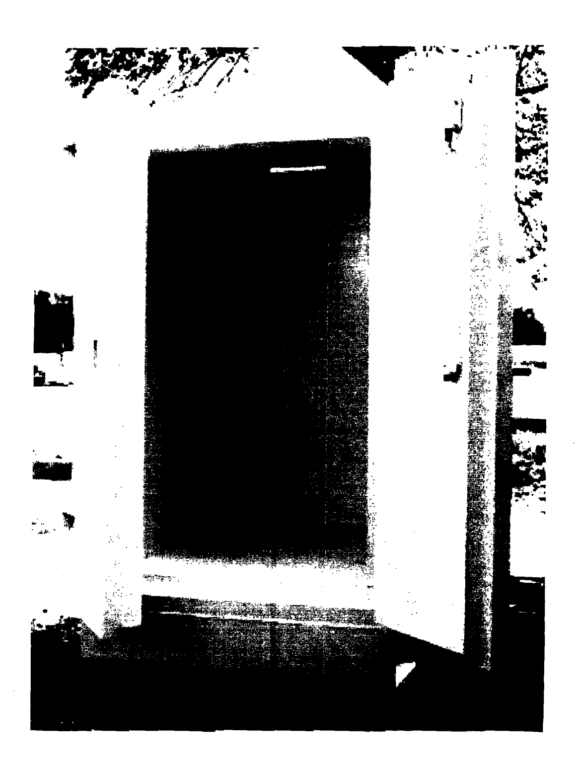
Figure 3. The shield cell (module 1)